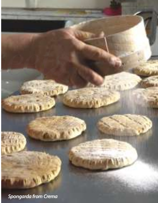
Spongarda from Crema

spongarda , (a type of cake - sweet, rich and refined, one of the oldest in Italy), and Bertolina cake (with a filling of fresh grapes).