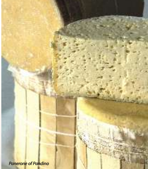
Panerone of Pandino

Leave it in the fridge for at least 2/3 hours. At the moment of serving add a small amount of extra-virgin olive oil and a sprinkling of pepper to the salva and mix it all carefully.