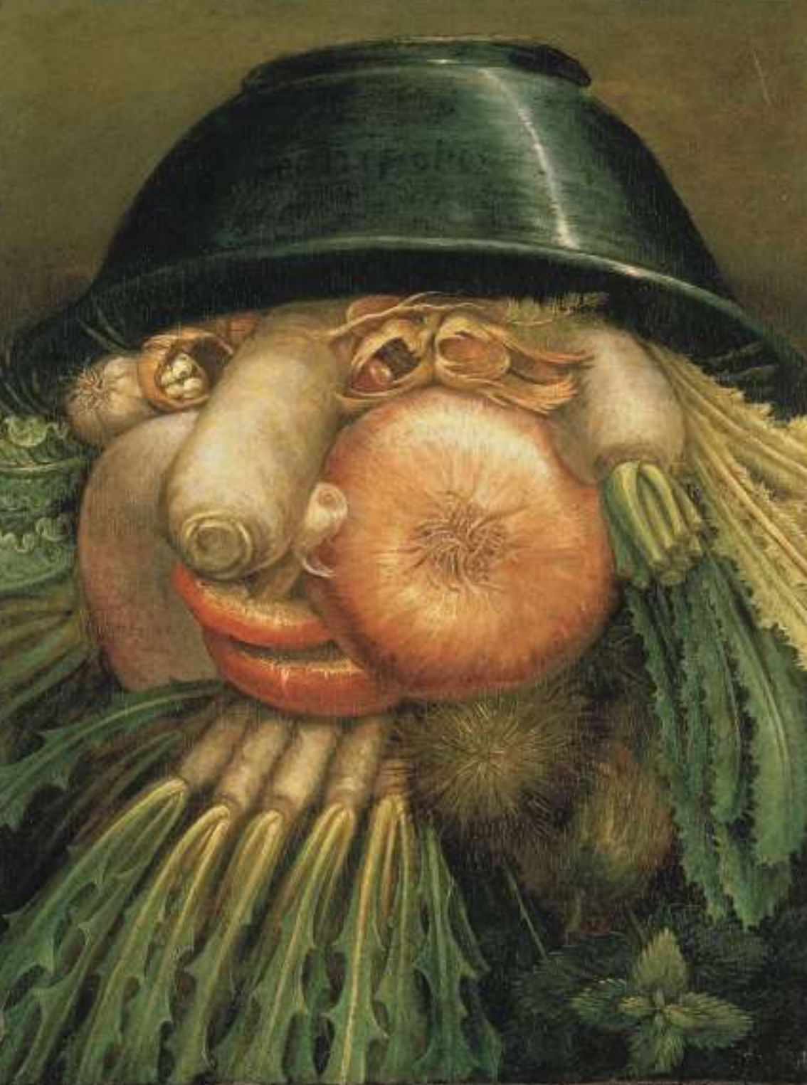
G. Arcimboldo, "The Gardener", Ala Ponzone Civic Museum, Cremona