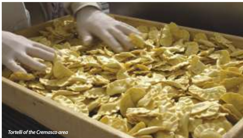
Tortelli of the Cremasco area

U.Tognazzi, “Il rigettario fatti, misfatti e menu disegnati al pennarello”, Fabbri, Milan 1978, pp. 128-131.