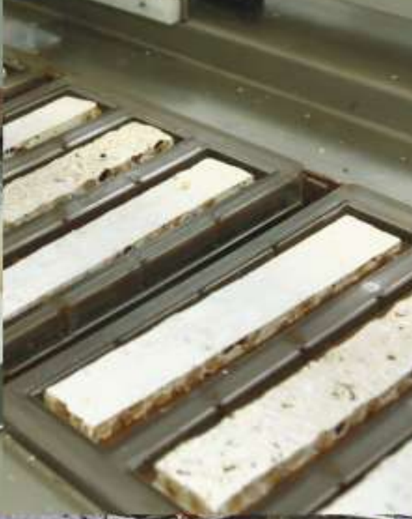
A stage in the processing of Cremonese torrone