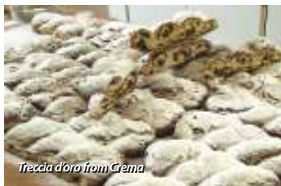
Treccia d'oro from Crema

Typical sweets of Crema and the Cremasco area are the treccia d'oro (gold plaits) (raised dough, cooked in the oven with crystallised orange and citron and with currants), the