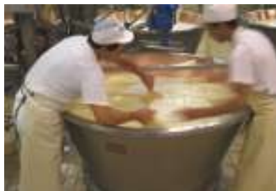
Stage in the processing of grana padano