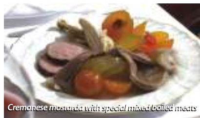
Cremonese mostarda with special mixed boiled meats

At the beginning of the twentieth century mostarda began its transition to industrial production, with brands that are still active and famous today. In the sixteenth century Cremona and its area were also noted for production of jam based on quince, and even today both quince jam and senapata (quince jam flavoured with mustard) are produced in the area. Both are marketed in characteristic wooden boxes.