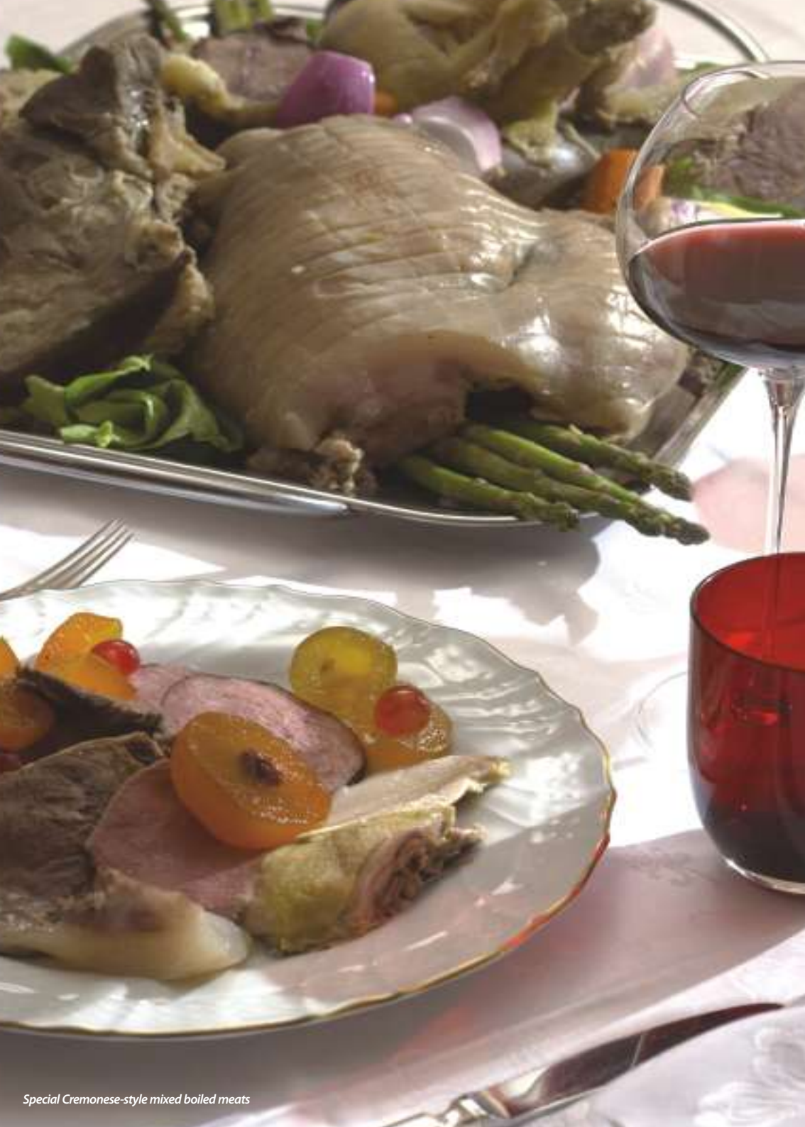
Special Cremonese-style mixed boiled meats