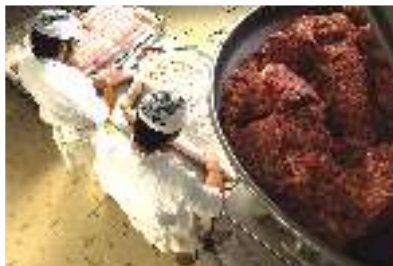
A stage in the preparation of Cremonese salami

Salame da pentola (salami to be cooked) (which at one time was used together with beef and chicken in the preparation of “tre bodi” (three broths) in which Cremonese marubini are cooked), is obtained from lean pork under-shoulder, the lean streaks in lard, and cured pork belly fat, salt, pepper