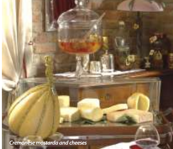
Cremonese mostarda and cheeses

The first recipe, Pour faire mostarde de Cremone (« To make Cremona mustard ») appears in a book published in 1604 : Ouverture de Cuisine by Lancelot de Casteau, cook of the prince-bishop of Liege. The Affaitati, rich Cremonese merchants who were very active in Flanders at the end of the sixteenth century, had close links with de Casteau. Among the ingredients mentioned are crystallised fruit, mustard, sugar and a vegetable colouring, turnsole, which would have given it a beautiful red hue. The recipe